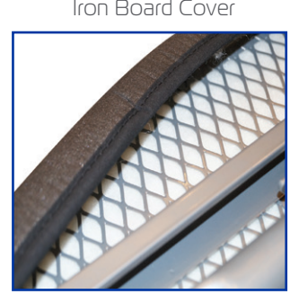
STEAM FLOW METAL MESH Top