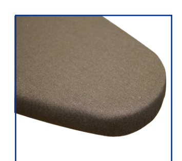
METALLIC HEAT REFLECTIVE Iron Board Cover

Board Dimensions Maximum Height Cover Material Cover Colour Frame Colour Board Dimensions 116(L) x 33(D) x 76(H) cm 76cm Cotton with Felt Underlay Charcoal Gray Silver Grey